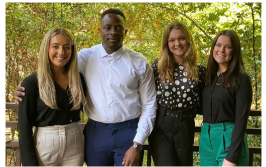
Our 2022 Trainee Solicitors